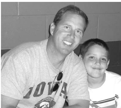
Male mentor and child.