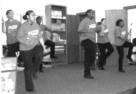
Dancers perform for students.

Another program offered at St. Mark Community Center is the “ THINK Together ” (Teaching, Helping, Inspiring, Nurturing Kids Together) program. The “THINK Together” Program is offered to students in 4th through 8th grades who attend school at Audubon, Marshall, Fulton, and Lincoln Elementary Schools or Jefferson Junior High School. The main goals of the program are to increase academic performance and school attendance as well as reduce office referrals.