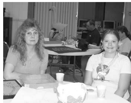
Parents enjoy their children's art.

The little children came on Saturdays and did mostly make-and-take activities, and about 15 older kids were signed up for Tuesday mornings June 20 to August 9 as part of their THINK Together program.