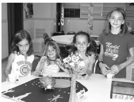
Art for all ages.

The art classes we offered gave children and youth the tools needed to understand human experience, adapt to and respect others' ways of working and thinking, develop creative problem-solving skills and communicate thoughts and ideas in a variety of ways. SMCC teaches the skills children need to bring creativity into their adult lives.